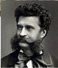
Johann Strauss, Jr.

The King of Waltz meets Dubuque's King of Dance!